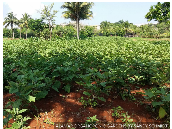
ALAMAR ORGANOPONIC GARDENS

This morning take a guided walking tour of Old Havana, a UNESCO World Heritage Site. Discover the four “plazas” in Old Havana: Plaza de la Catedral, Plaza Vieja, Plaza de San Francisco de Asis, and Plaza de Armas. Learn about the ongoing restoration projects throughout Havana, and see the giant model of the city. After lunch at Hemingway’s Old Havana favorite — Sloppy Joes — enjoy a private performance of Danza-Teatro Retazos. This incredibly talented group of dancers and their instructor will amaze and delight you, as they have been doing for audiences not only in Cuba, but internationally in the US and Europe. This evening, dine at the private restaurant La Guarida, which is the location of the Cuban Oscar-nominated film “Strawberry and Chocolate.” Overnight at Meliá Cohiba or similar (BLD)