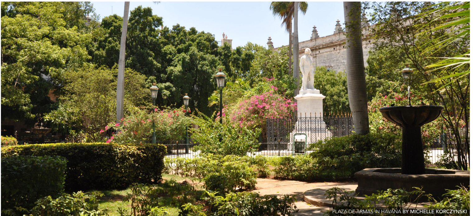
PLAZA DE ARMAS IN HAVANA BY MICHELLE KORCZYNSKI